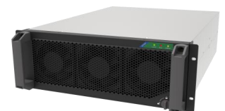
75kW UPS Module