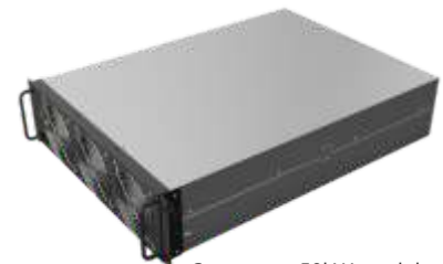
Structure - 50kW module